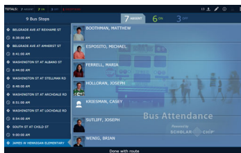
View of students assigned to a bus stop